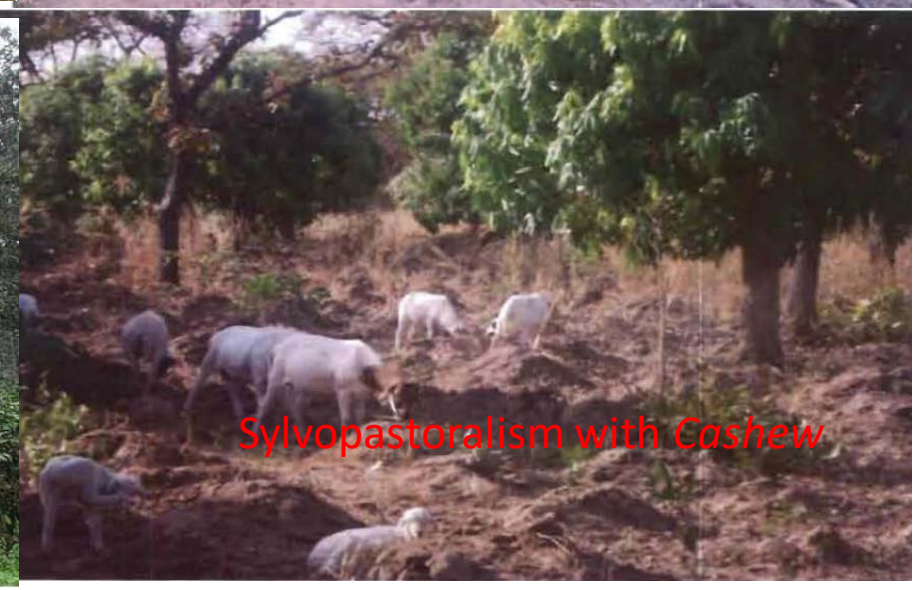
Sylvopastoralism with Cashew