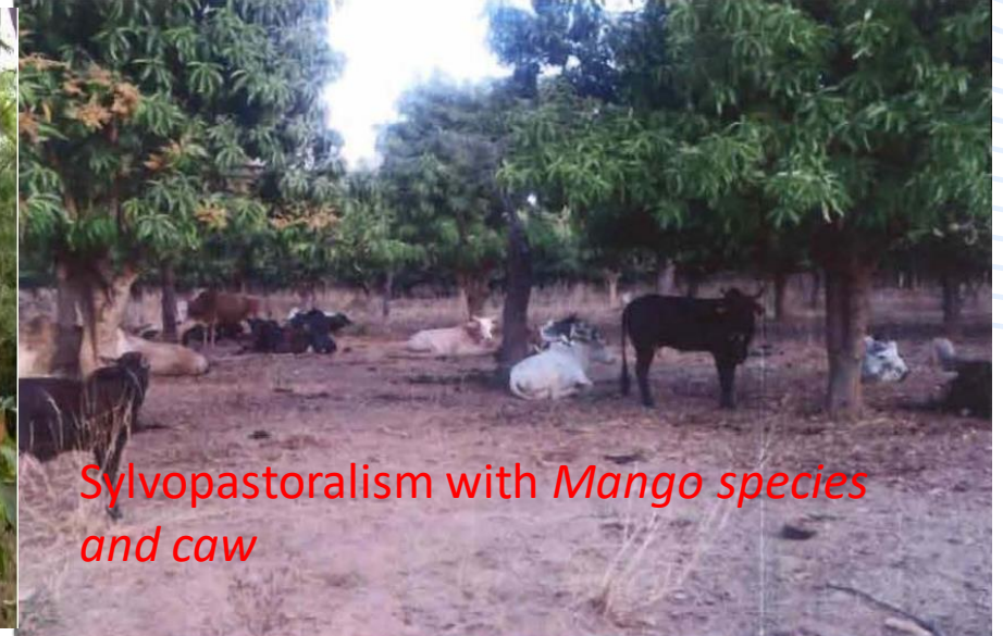
Sylvopastoralism with Mango species and cow