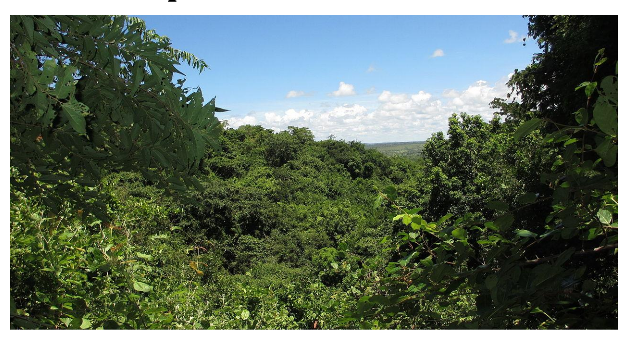
A moist forested gulley at Pemba Mozambique.