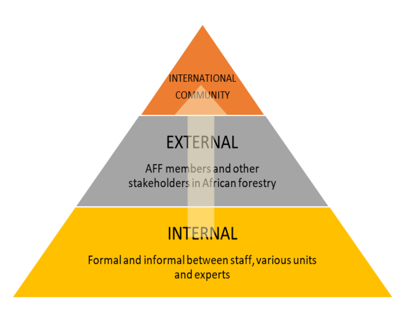
Figure 2: Knowledge sharing at AFF

organization where tools and/or systems will be used to capture, store, and effectively share knowledge. The result will be a more integrated and systematized knowledge management system which will benefit external audiences and boost AFF's positioning, relevance, and visibility (see Figure 2).