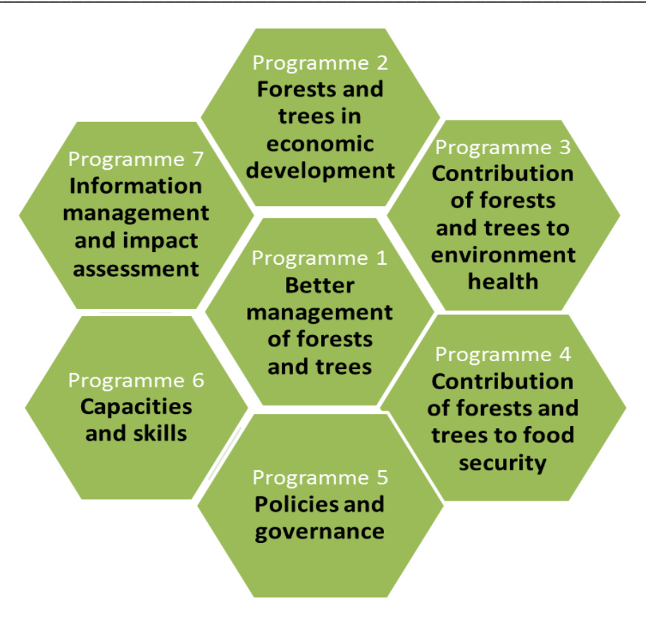
Figure 4: The AFF's programme structure

In all this work, AFF seeks to achieve the following goals: