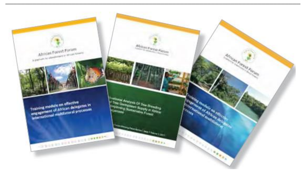
Figure 3: Sample of some knowledge products produced by the AFF

These channels include regular media engagement; dissemination of scientific publications and newsletters; development of tailor-made web content; advocacy and outreach; social networking; events and partnerships.