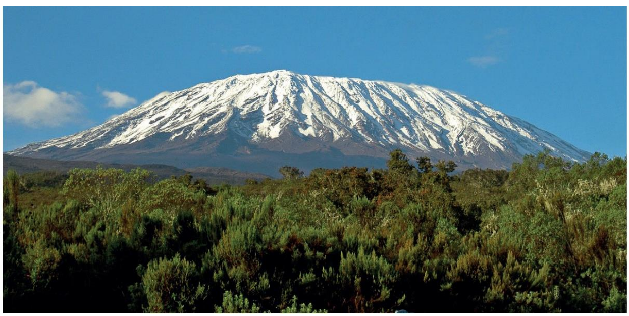
Photo: Forest cover at the foot of Mt Kilimanjaro, Tanzania.