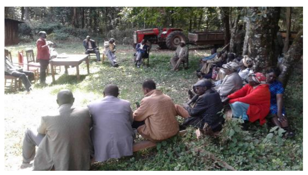
Photo: Faidherbia albida parklands in Mali