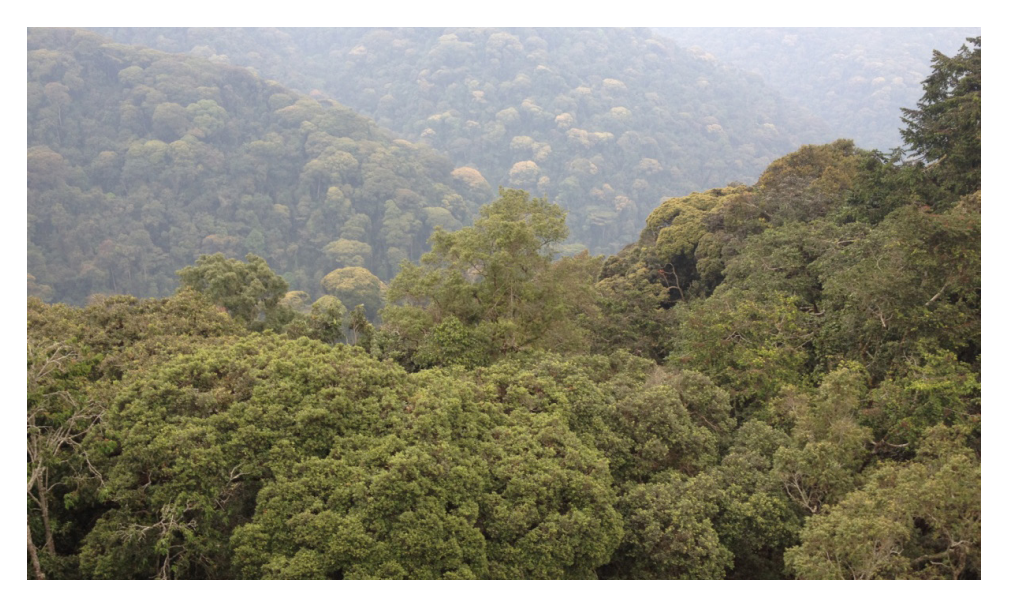
Figure 6: Nyungwe National Park, Rwanda is a reservoir of biodiversity. Here we get an aerial glimpse of the forest from the Uwinka Look Out suspended bridge.

The contribution of forestry resources to economic growth and poverty reduction is expected to be attained by the increase of forest cover across the nation as well as the increase and sustainable management of ecosystems and forestry resources. Thus, Rwanda's EDPRS II retains forestry as a main focus in recognition of its prime contribution to the GDP. Targets to be achieved through increased job creation in forestry range from 0.3% to 0.5% by 2018, a reduction in the use of biomass energy through the use of improved stoves is expected and improved kilns are expected to produce 75% of charcoal by 2018. EDPRS II also supports the previous target of increasing forest cover to 23.5% by 2012 and has reset the cover indicator to reach 30% by 2018. In addition, EDPRS II recommends sustainable management of forest biodiversity and critical ecosystems through protection and maintenance of 10.25% of the land area and reduction of wood energy consumption from 86.3 % to 50% by 2020 as reflected in the 2020 Vision targets (Republic of Rwanda, 2013).