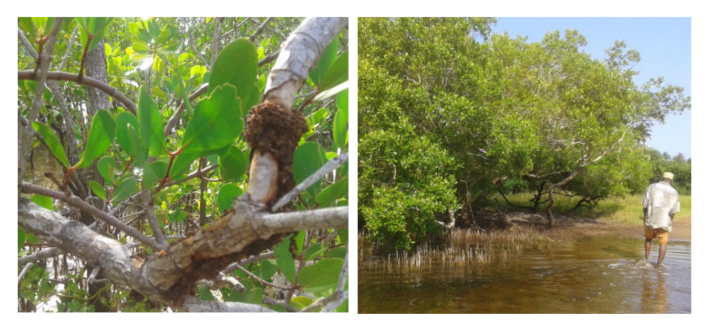
Figure 4 : Mangrove shoot borer damage in Gazi Bay, Kwale County, Kenya.

The role of forests in sustainable development was also quite clearly defined in Kenya's economic blue print Vision 2030 . Forests fell under the social pillar of the Vision in the environment, water and sanitation sectors. The target set during the Vision's time scale was to achieve at least 10% forest cover (Government of Kenya, 2007). The second Medium Term Plan of the Vision, spanning 2013-2018, featured flagship projects and programmes that focused on the ecosystem and participatory forest management as necessary to support SFM (Government of Kenya, 2013). Bamboo, commercial forestry and other nature based enterprises were to be promoted for poverty alleviation and environmental sustainability. Such programmes would be implemented both on farmlands and dry-lands in collaboration with Community Forest Associations.