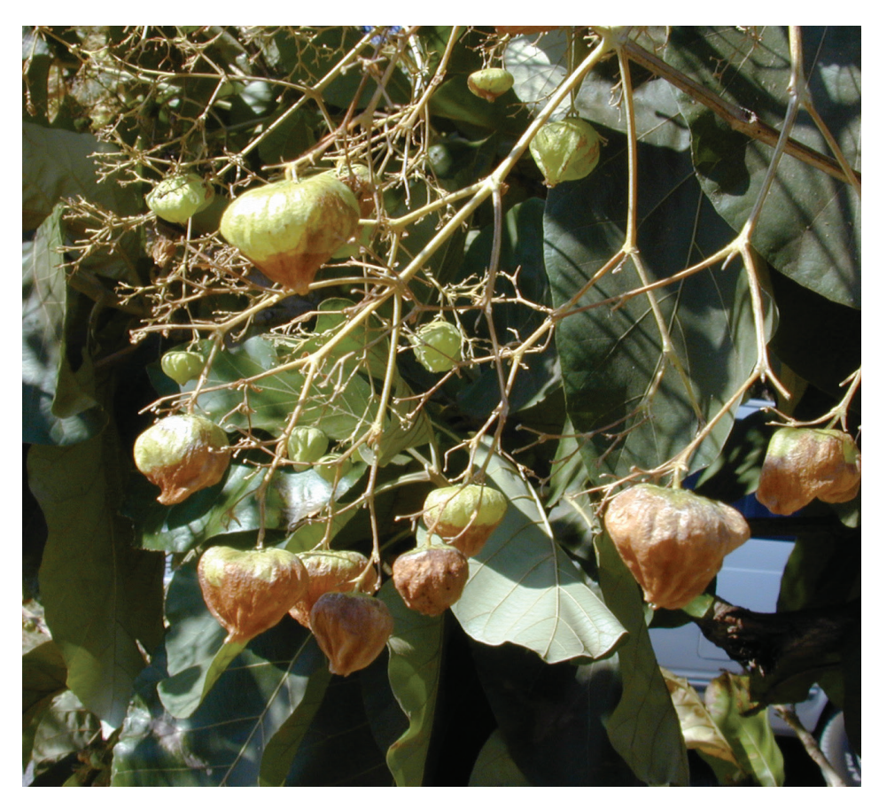
Teak (Tectona grandis).

Today, exotic species, such as eucalypts, pines and teak, dominate plantation forests in Africa, but there are strong signals that the 'immunity' of exotic species to pests and diseases is gradually breaking down. In Ghana, for example, popular plantation species like teak ( Tectona grandis ) and cedar ( Cedrela odorata ) which have been widely planted because of their resilience to pests and diseases appear to be succumbing to attacks.