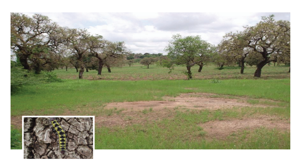
Plate 4. Cirina forda outbreak on shea nut trees (Vitellaria paradoxa) observed in Bolgatanga, Ghana in August 2004.

Parkia vitellaria, Gliricidia sepium, Leucaena leucocephala and Faidherbia albida are important trees for agroforestry or parkland farming systems throughout the subregion. Teak and various species of Eucalyptus are also commonly used in agroforestry or parkland farming systems. Nearly all of them suffer severely from termite infestations. Development and promotion of integrated pest management strategies in agroforestry setups will therefore be very necessary.