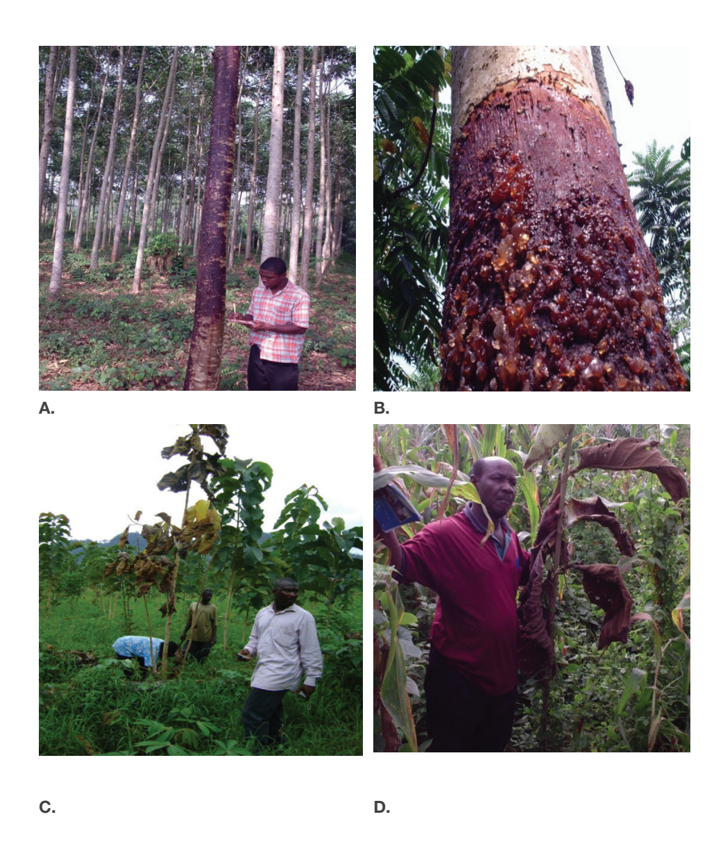
Plate 2. A. Stem canker on Cedrela odorata . B. Cedrela odorata stem canker in advanced stage. C. Suspected Armillaria root disease of Tectona grandis in Ghana. D. Root disease of T. grandis in Ghana caused by poor site conditions. (Photos by P.P. Bosu ).