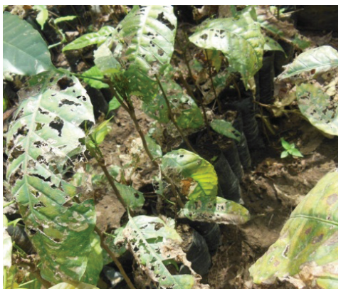
Plate 3. Left : Species of snail that damage Khaya ivorensis seedlings at the nursery of the FORM Ghana Plantation Estate, Akumadan (Photo by M.M. Apetorgbor ). Right: Seedlings of K. ivorensis defoliated by snails. (Photo by L. Amissah ).