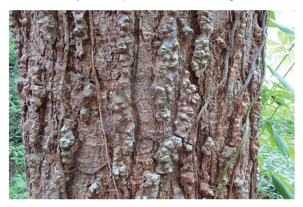
Close up of the cedar (Cedrela odorata) trunk.