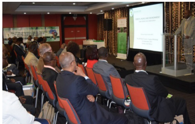
AFF Participants at the Pre-XIV WFC workshop in Durban