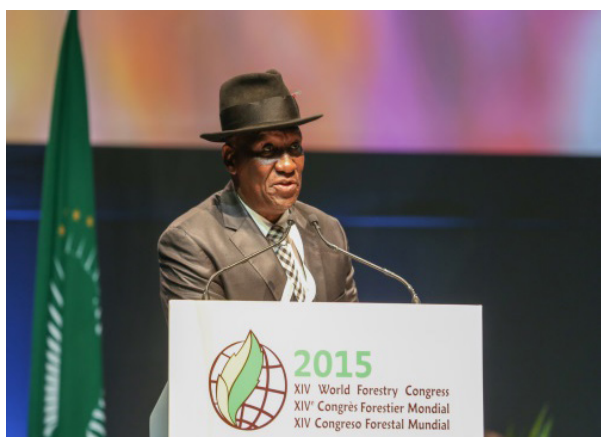
Mr. Bheki Cele, Deputy Minister of Agriculture, Forestry and Fisheries, South Africa at the Opening Ceremony of the XIV WFC.