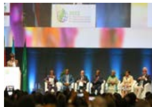
View of the dais during the XIV WFC opening plenary.

FAO Director-General José Graziano da Silva used the platform to officially launch FAO's latest Global Forest Resources Assessment (FRA) 2015, a resource that reveals how the world's forests have changed over the last 25 years and that provides the latest information on the state of sustainable forest management.