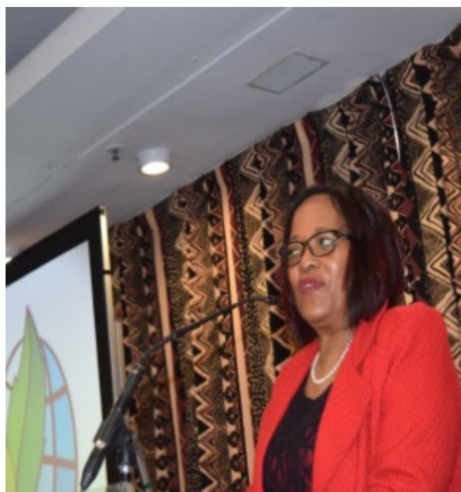
Ms. Edith Vries, Director General of the Department of Agriculture, Forestry and Fisheries in South Africa delivering the keynote address at the opening of the Pre-XIV WFC workshop in Durban.