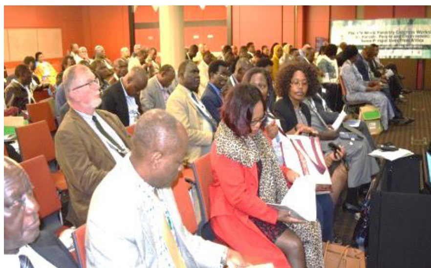
Plenary session of the Pre-XIV WFC workshop held at the Inkosi Albert Luthuli International Convention Centre in Durban.

Also the need for aligning Africa's programmes with international processes is gaining currency. Various projects, programmes and initiatives have been developed on natural resources, and forest resources in particular, to position the various sub-regions in the development of Africa's forestry agenda. Many of these initiatives are few and at their infancy, the continent still needs to do much more at the sub-regional and regional levels, and this requires considerable resources.