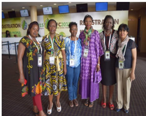
AFF participants at the venue of the 14th World Forestry Congress (WFC XIV) in Durban South Africa.