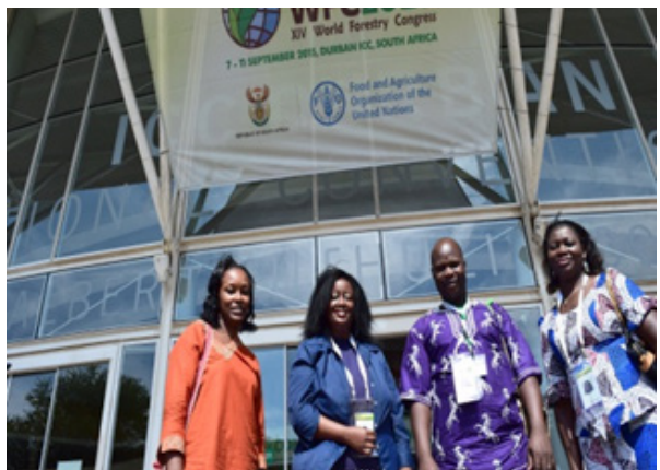
AFF secretariat at the ICC in Durban, South Africa.