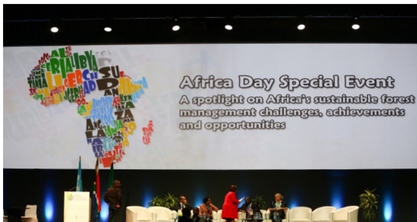
Africa Day special event held on 8 September 2015 in Durban, South Africa

In Africa, nearly all issues in the forestry debate of today revolve, directly or indirectly, around deforestation and forest degradation. Although current information as reported by FAO indicates a decrease in net forest loss in Africa, deforestation still remains a key challenge in many countries. The pre-XIV World Forestry Congress workshop was a unique opportunity for stakeholders in African forestry to better understand the broader context in which deforestation, forest and land degradation has been taking place and especially why it is so rapid in Africa as compared to other continents.