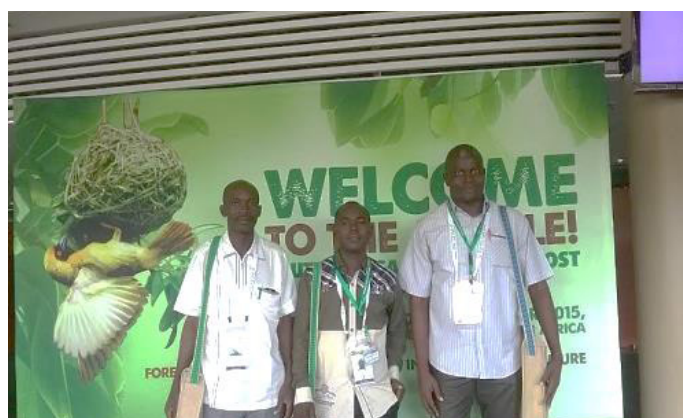
AFF participants of the pre-XIV WFC workshop held from 4-5 September 2015 at the ICC, Durban.