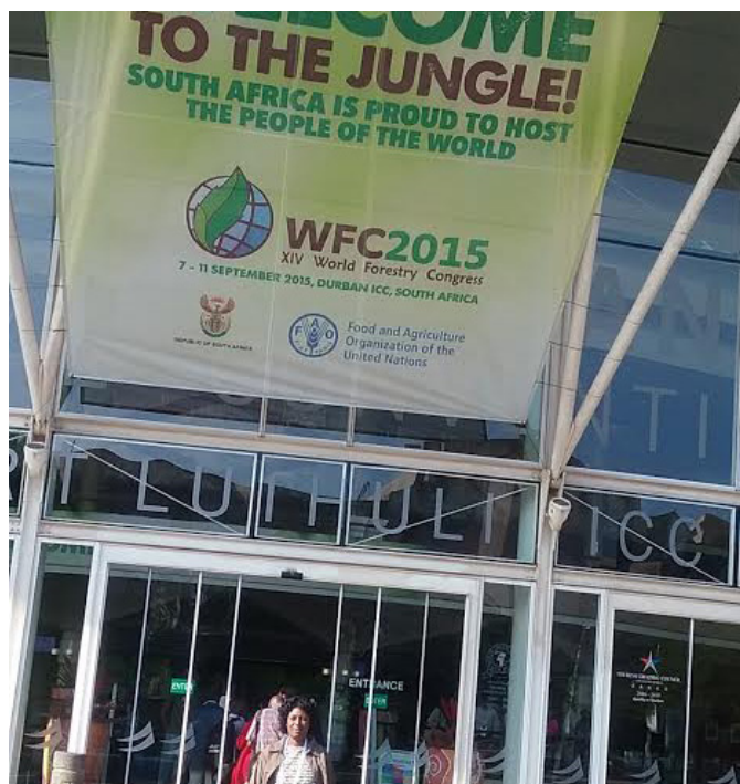
A view of the Inkosi Albert Luthuli International Convention Centre (ICC), venue of WFC XIV.