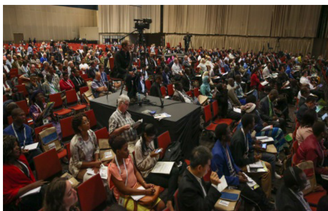
Delegates during plenary, XIV WFC.