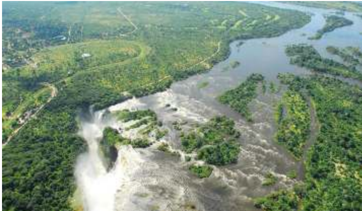
Figure 12. All major rivers in Africa originate in forested or wooded areas. The protection and wise management of these forests are crucially important for the continent's future water supply.

Finally, an old and well known environmental relation involving forests is coming into prominence again, viz. the role of forest vegetation and trees on the hydrology of river and lake basins (see also section above on food security). Already a hundred years ago, when colonial powers started to create forest reserves in African countries, the explicit justification was to protect water sources (and, of course, also to safeguard the supply of timber). Rapid population increase and resulting deforestation caused by the need for new agricultural land have put a new focus on the issue of water availability and hydrology.