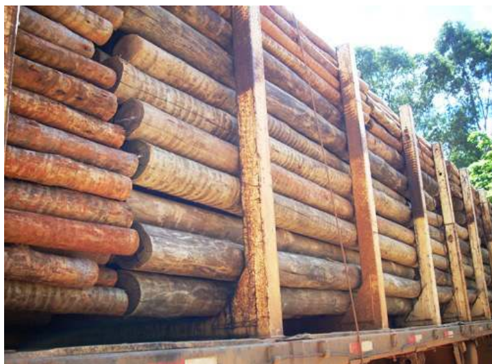
Figure 13. In recent decades, there has been an explosion of demand for electricity transmission poles, which has created a very lucrative economic business for farmers, particularly in Eastern and Southern Africa.

It is not only, but mainly, in the form of the primary and added value of wood and non-wood forest products, but may also include direct financial benefits of conservation through, for example, ecotourism, or ecosystem services such as soil fertility enhancement and water availability, all of which can be expressed and measured in quantitative and economic terms. All other values and roles of forests, including essential and desired ones, such as carbon sequestration, aesthetic and scientific values, biodiversity and species protection, etc. can only be significantly fulfilled in combination with economic values (which is often possible, but requires compromises), or by political and moral commitments from governments to compensate for lost economic opportunities where conflicting uses cannot be reconciled.