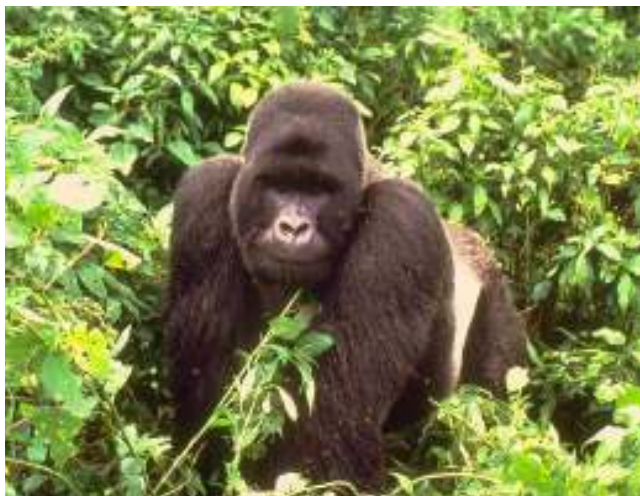
Figure 11. Efforts to protect mountain gorillas and their montane forest habitat seem to have had a modest success in recent years in spite of disturbances caused by civil war.

One environmental aspect of forests in Africa that remains important but which seems to have lost some of the prominence given to it only ten years ago (no doubt related to the emerging focus on climate change issues), is the role of forests and other tree-dominated ecosystems in biodiversity conservation and management. Biodiversity, in the sense of the variation of species and varieties of plants and animals, the genetic variation within them, as well as variations in their habitats have been in the focus of international attention and programmes since the Convention of Biological Diversity (CBD) was put in place following the 1992 meeting in Rio de Janeiro.