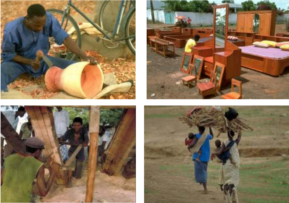
Figure 2. Examples of the multitude of primary, secondary and tertiary wood products which normally fall outside formal markets and official statistics and, thereby, taxation. Still, a number of necessities are produced outside the official market, and millions of people derive their livelihood or part of it from such endeavours (photos 1, 3 and 4 FAO, 2 author).

Again, there is also substantial informal secondary and tertiary tree and wood products activities , e.g. in the chainsaw milling and pit-sawing, building material (scaffolding), furniture, wood carvings, and other sectors. Actually, the main sources of forest-based employment and economic activities, including in value adding and trade of wood products, in most countries are found in these informal and domestic sectors. These are normally not captured in official statistics and therefore their economic importance is difficult to quantify. For example, FAO estimated that c. half a million people in SSA (FAO 2014b), while at least three times more people are employed in the informal sector, mainly related to fuelwood and charcoal (FAO 2014a).