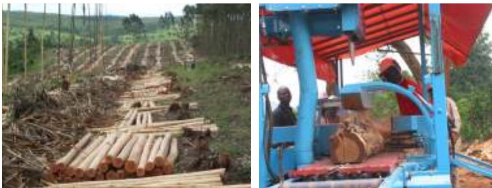
Figure 16. Rational production of wood through plantations has an enormous potential in much of Africa, from small-scale farm woodlots to large scale commercial plantations. There is a need for improved sustainable management techniques as well as for improved plant material to fully exploit the potentials of plantations.

Management of forests and trees, i.e. raising seedlings, planting them in forests, plantations or on farms, silviculture (e.g. thinning, pruning, removing undesirable competing plants, etc.), logging and harvesting (whether of wood or NWFPs), transport to industry and other users, is important in order to get products of the right quality and quantity at the right time. In agroforestry and other integrated land use systems, management also involves how to combine the trees in space and time with other components of the systems. There is, and has been for a long time, quite a lot of relevant R&D work going on in Africa on many of these aspects, particularly related to commercial and larger scale forest operations in plantations and in natural or semi-natural forests, and more recently on managing trees in agroforestry systems. A special management need today, particularly in some countries in Eastern and Southern Africa, is the rehabilitation of tens of thousands of hectares of neglected and mismanaged, but potentially very valuable, public forest plantations ( Chamshama 2011 ).