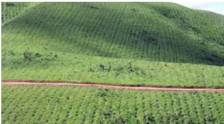
Figure 5. Growing competition for land for food, fibre and fuel in Africa is a major concern, but also an opportunity to attract valuable investments.

The latter point leads us to a more controversial trend affecting the future of forestry in Africa, viz. that of increasing competition for good land between food crops, commercial bio-energy production and forests/forestry (the so called 3F-question – food, fibre and fuel ), which is a rather recently highlighted development ( KSLA 2012; Chipeta 2012 ). Africa is a continent which certainly has vast expanses of land with sparse population and extensive current land use - e.g. the miombo woodlands of Southern Africa, savanna woodlands in Eastern Africa and the rain forest regions of Central Africa – all moderately suitable for large scale production of food and energy crops and timber plantations.