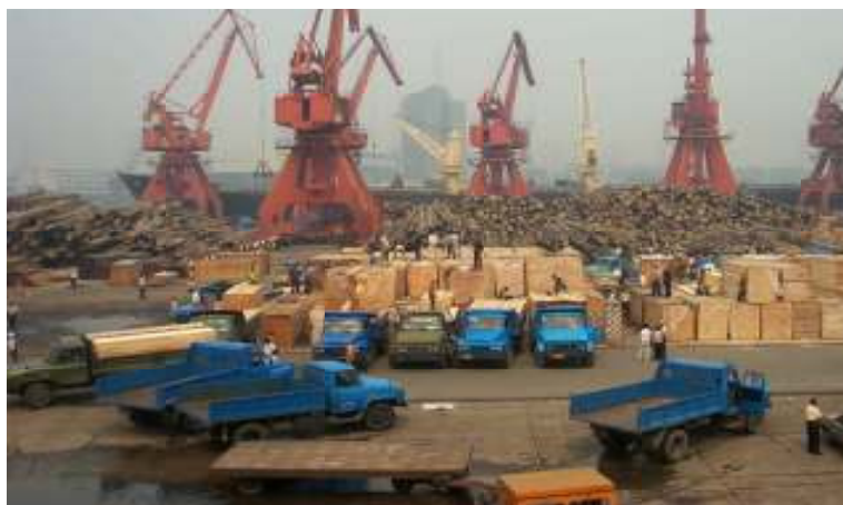
Figure 8. The importation of wood, both in the form of logs and sawn timber, to China has increased by 7-10% per year for the last two decades. Timber from Africa, not always legally cut and exported, form an increasing part of this import. Picture from a harbour in China.

Although wood for fuel, including charcoal, still accounts for the bulk of both volume and value of tree-derived products, conventional forest products, such as timber and pulpwood, are rapidly increasing in importance. Since long, plantation-based forest industry in Southern Africa, timber from concessions in Central Africa, and pockets of natural timber stands and plantations (often government owned) feeding a small-scale sawmilling industry in some parts of Eastern and West Africa, are the main forms of commercial, formal, primary and secondary forest operations. Today, such activities are rapidly increasing and private, cooperative and community investments in forest plantations and forest industry are visible in many parts of the continent.