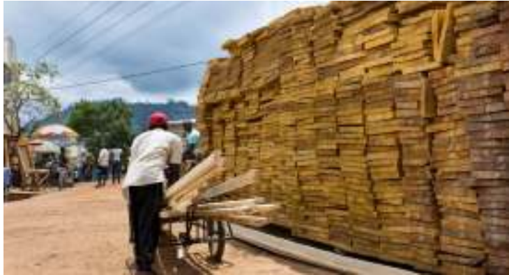
Figure 3. “Informal” wood for sale at a market in Yaoundé. Today illegal but giving employment to thousands of people and providing more with essential wood products.

The value of non-timber forest products (NTFPs), i.e. food, fodder, medicines, gums and resins, etc., is even more difficult to get reliable figures on, more than the fact that in large parts of Africa such NTFPs constitute a major source of nutrition and income for, particularly, rural people (Agustino et al. 2011). A very coarse and unreliable estimate puts the annual value of trade in NTFPs in Africa at USD 500 million (FAO 2014b), which undoubtedly is a gross underestimate.