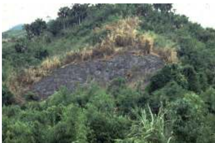
Figure 4. Deforestation is still rampant in many parts of Africa, still predominantly caused by clearing of forests and woodland for small-scale agriculture.

It goes without saying that any attempt to make generally valid statements about current features and trends regarding forests and trees, as well as the cause and effect mechanisms behind such features and trends, runs the risk of over-simplifications. Africa is enormously big and varied with regard to economic, social and ecological conditions – from multi-million mega-cities to very sparsely populated arid areas, from raw material- and industry-based economies to traditional subsistence agriculture, from deserts to moist humid regions to alpine meadows, from a relatively wealthy middle class to abject poverty in some rural areas and city slums, from well-functioning democracies to disintegrating countries, etc. Nevertheless, it is permissible to identify some overall current trends, issues and needs (see also Nair and Tieguhong 2004; Kowero et al. 2009 ) which set the scene for analysing the roles of forests and trees in the coming decades, as discussed below.