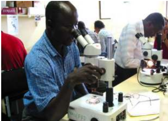
Figure 15. Forest research needs to be strengthened and, particularly, focus on problems and potentials of real relevance to Africa.

funding for their work, including small (e.g. through IFS and various NGOs) and larger (e.g. IDRC and some bi- and multilateral agencies) research grants, partnership arrangements, and opportunities for Ph.D. studies abroad.