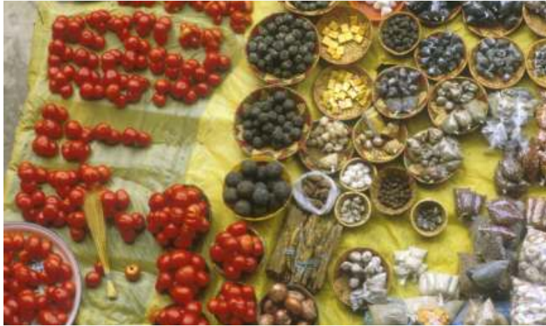
Figure 9. Edible products from the forest are essential components of food security in many parts of Africa.

This also applies to the very significant role of leaves, twigs and shoots for fodder for domestic animals. Thus, the dual economic and nutritional potential of forests and trees can, and does already, contribute to food security among rural and urban poor. The potential of significantly increasing such contributions, e.g. from charcoal and building poles, was highlighted above.