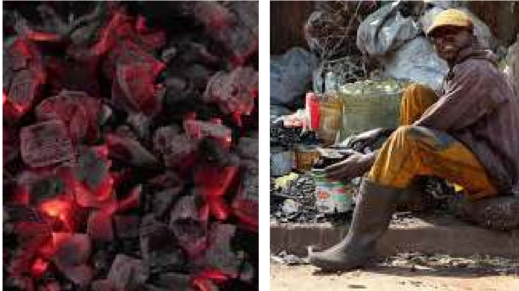
Figure 6. The production, transport and sale of charcoal are probably the largest informal wood-based economic sectors in Africa today.

The Tanzanian study indicates a similar magnitude in charcoal trade and in its income earning potential with an annual value of USD 650 million per year, creating 2 million full- or part-time jobs. For example, it is estimated that the city of Dar es Salaam alone uses in excess of 1.6 million bags of charcoal annually! Neither of these figures ends up in official GDP or employment statistics, and the estimated loss to GoT was USD 100 million as a result of missed taxation incomes ( World Bank 2009 ). Also in Uganda, a recent study showed a great economic value in the production, transport and sale of charcoal ( Shively et al. 2010 ).