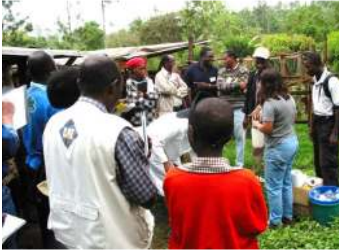
Figure 14. The need for training of trainers, in the form of medium level forest extension personnel is enormous in Africa today.

The major staff problem for the forest sector today, however, is not at the academic level but at the field technical level. The very poor and deteriorating situation in training of people at Technician, Certificate and Diploma levels was pointed out already a decade ago by ANAFE (Temu 2006; Temu et al. 2006). For a variety of reasons, Forest Schools ceased to exist or experienced increasing problems in attracting students and resources. This has created a situation today of very serious shortages of staff at middle management and field operation levels, i.e. staff responsible for forest management operations (logging, planting, silviculture, transport, etc.), nurseries, small-scale forest industries, extension services, day-to day supervision and protection of forest resources, law enforcement in the field, etc. For most African countries with an ambition to make forests and trees outside forests contribute to economic development and food security, this is by far the most urgent problem to address. Again, regional training centres are an interesting option. It is also essential to make the training more attractive to students, e.g. by introducing components in curricula focussing on entrepreneurial and business skills to make graduates from Forestry Schools more attractive to the private sector and more able to take up forest-related business themselves, rather than focussing solely, as has been the case to date, on creating junior and middle level civil servants.