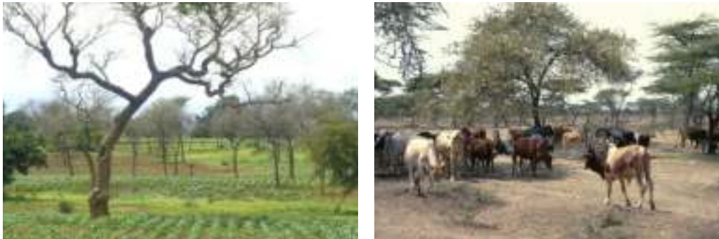
Figure 10. In much of Africa there is a rather dense tree cover in various agroforestry and silvo-pastoral land use systems. Much R&D efforts today, e.g. by ICRAF in collaboration with national institutions, aim at improving such tree components and systems.

It is obviously difficult to put reliable monetary values on the potential importance of using trees to improve soil fertility, but one recent example from southern Niger is impressive. Here, a “re-greening” campaign through Farmer Managed Natural Regeneration (FMNR) of trees/shrubs on 5 million ha of degraded land led to a doubling of agricultural yields and the N-fertiliser equivalent of the trees’ impact was estimated at USD 500 million (Reij et al. 2009; Pye-Smith 2013; Sendzimir et al. 2012). A major regional initiative today that has multiple goals of improving food production, enhanced local economies and improve the environment through tree planting, agro-forestry and land restoration techniques is the Great Green Wall of Sahara and Sahel Initiative (GGWSSI), supported by the African Union, FAO, the World Bank and others (Abdou 2014a).