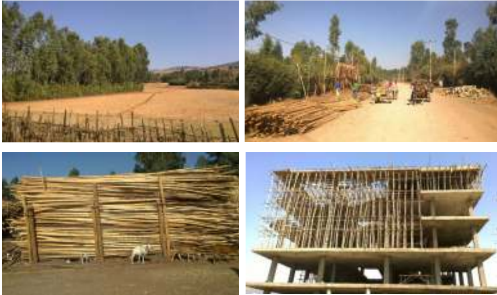
Figure 7. The market chain of Eucalyptus scaffolding poles for the construction boom in Addis Ababa – from small farmer woodlots, sale along the roads, transport to AA, sale to builders (at USD 2.50 per pole!) for use in construction work, and finally ending up as excellent firewood - is a huge and expanding but largely unquantified business.

Another high value product that many farmers in Eastern Africa today benefit from producing are electricity transmission poles from Eucalyptus spp. It is estimated that for East Africa alone (Kenya, Tanzania and Uganda) there is a market of 3 million such poles per year and it is growing 3 .