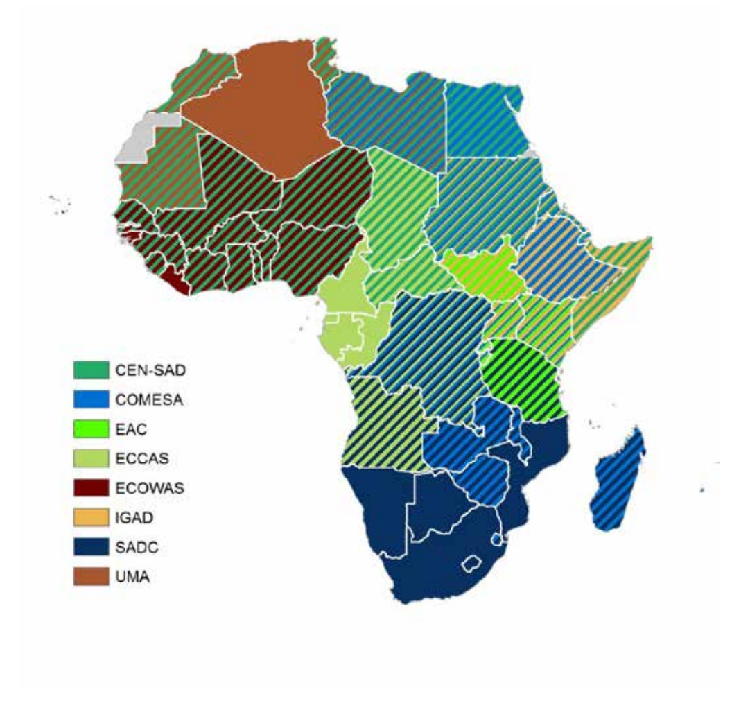
Figure 3. Regional Economic Communities of Africa.

The member states of SADC are Angola, Botswana, DRC, Lesotho, Madagascar, Malawi, Mauritius, Mozambique, Namibia, Seychelles, South Africa, Swaziland, Tanzania, Zambia and Zimbabwe.