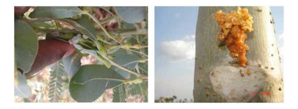
Figure 2 . Left: Suspected blue gum chalcid, Leptocybe invasa, galls on young Eucalyptus plants in Niger. Right: Vigorously growing Cedrela odorata pushes stem borer following attack. (Bosu, 2016).

Various species of Eucalyptus are widely planted in the sub-region, among which are E. camaldulensis, E. territicornis and E. alba. They are grown for pulp, poles, amenity or wood fuel. Worldwide, eucalypts are highly susceptible to pests and diseases, and the blue gum chalcid (BGC) Leptocybe invasa has caused significant losses in Eastern and Southern Africa. During the field survey in Niger and Senegal, leaf galls characteristic of BGC attacks were observed on saplings of Eucalyptus in plantations (see Figure 2). In Senegal, the observation was made in a small plot of Eucalyptus located within the city of Dakar. In Niger, the observation was made on saplings in an 80 ha plantation established in a town north of Niamey. In Ghana, BGC attack has been reported in a plantation at Kwame Danso, in the Forest- Savannah Transition zone.