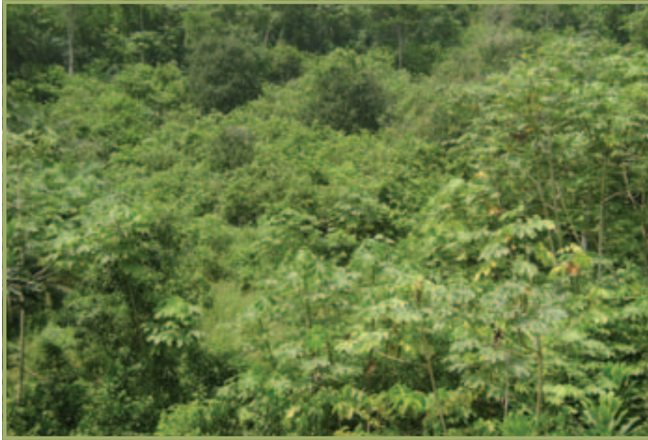
Evergreen forest near Ankasa game reserve, south-west Ghana