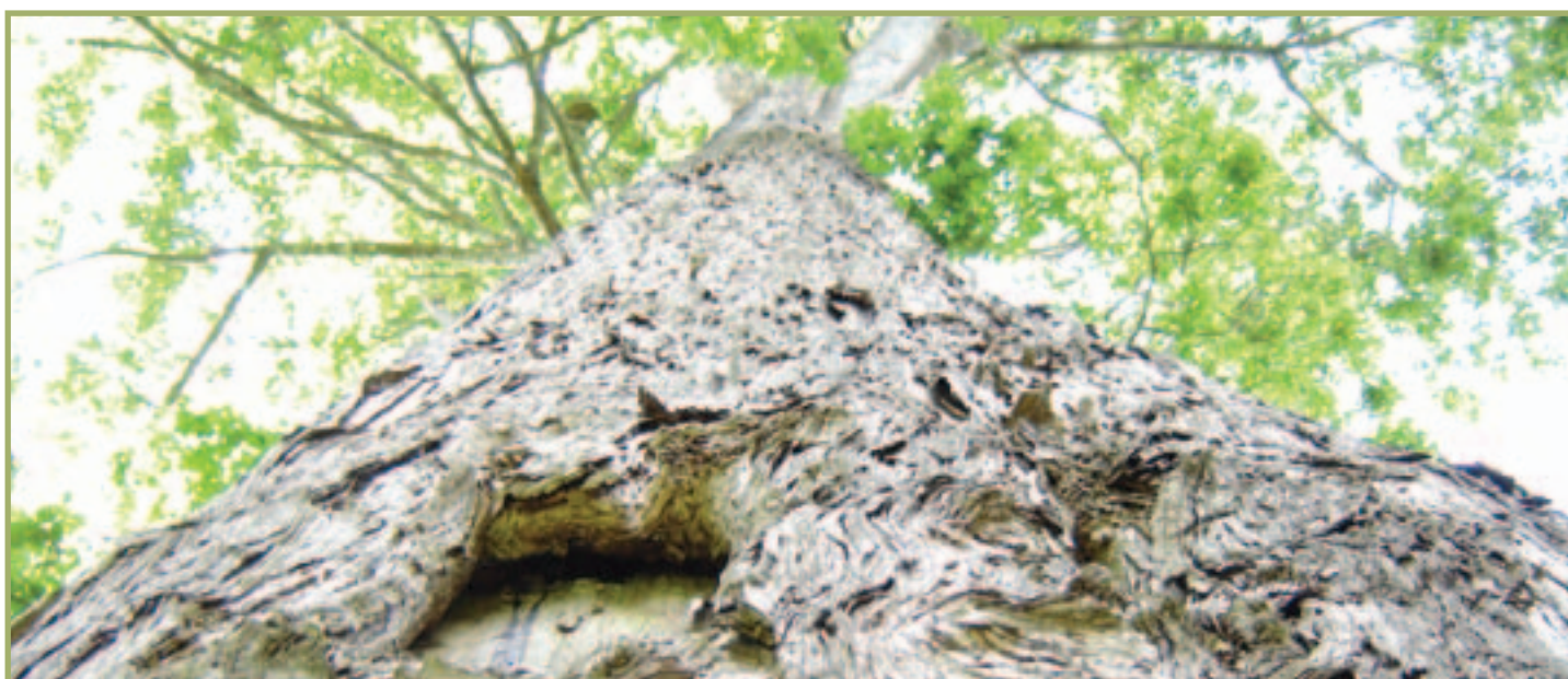
Afromontane forest, near Meru, Kenya