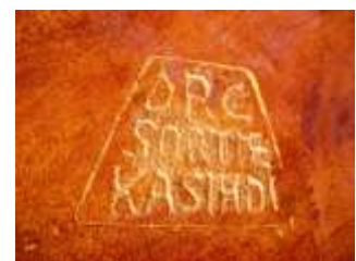
Figure 2: Timber hammer stamp mark at the DRC Border of Kasindi

Working with both FLEGT approaches hold considerable potential to address and eventually eliminate illegalities in the forestry sector, in addition to promoting SFM.