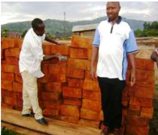
Figure 1: The process of marking DRC timber with special hammer marks

used in FLEGT processes have been applied to address forest resource related crimes. This has been demonstrated by tracking of illegal timber, arresting and pressing charges punishable under criminal laws such as conspiracy, smuggling, issuing false statements and money laundering.