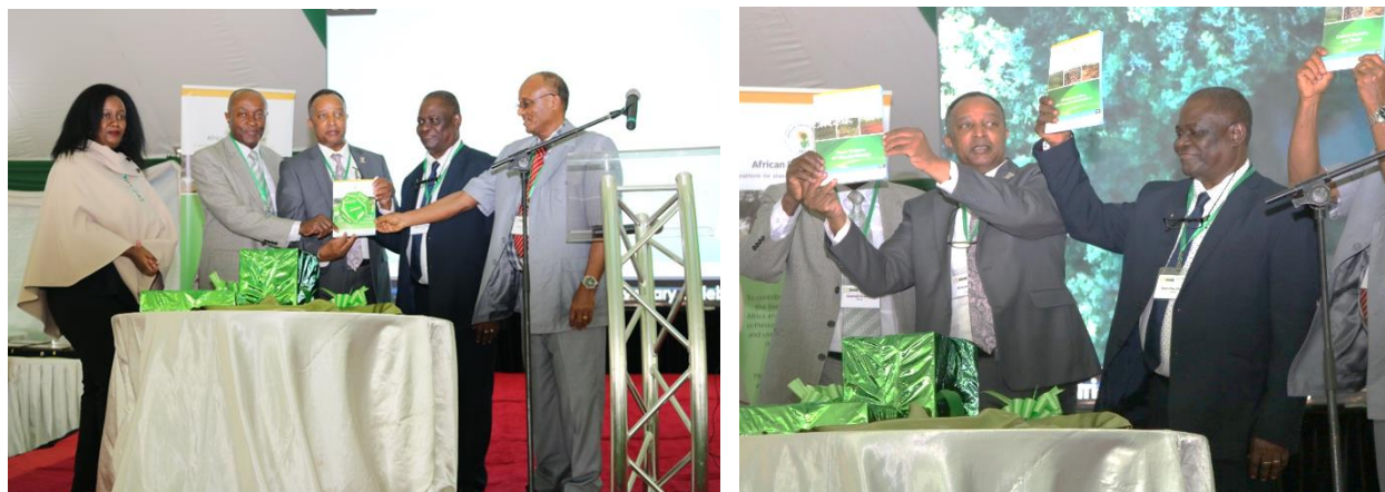
Photo L-R: AFF Founding Members with the Conservation Secretary, Kenya; AFF Governing Council Members with the Conservation Secretary, Kenya