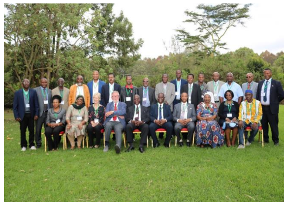
Photo L-R: AFF Founding Members with the Conservation Secretary, Kenya; AFF Governing Council Members with the Conservation Secretary, Kenya