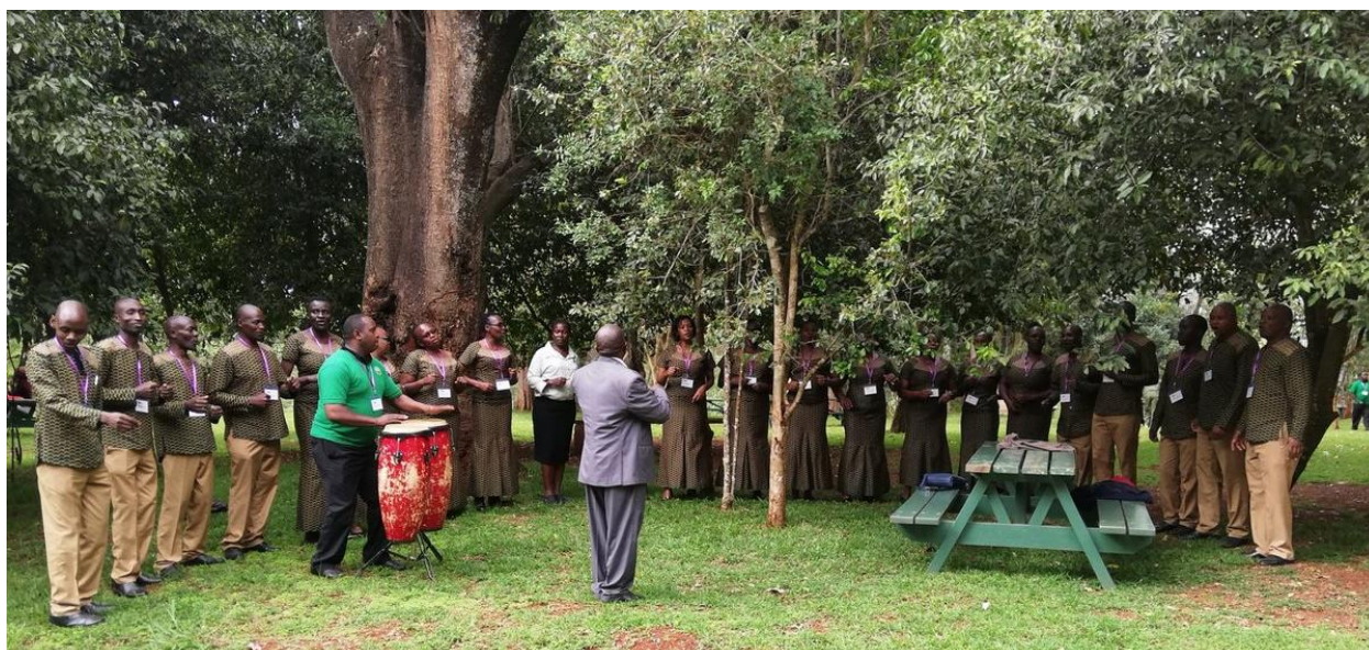
KFS Choir entertaining guests during the tree planting session